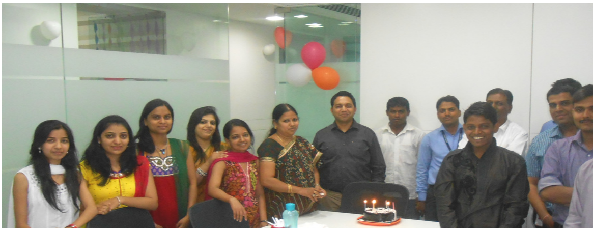
12 th March 2014 when InterJAS Logistics turned 6 Year . Company Day Celebration

Celebrations @ InterJAS Logistics Pvt. Ltd