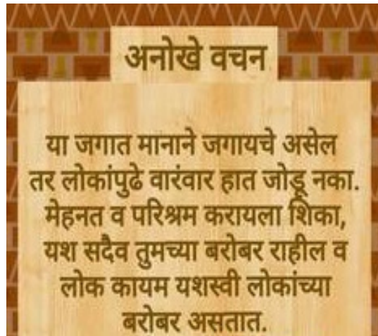
Shared By: - (Pandurang Gade)